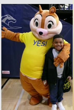
The highlight of the Reading Day game was the debut of Savemore the Squirrel , mascot for Benchmark's YES Club.

The athletics sponsorship was something new for Benchmark, which has always believed in supporting the school. What a fun and beneficial way to do it!